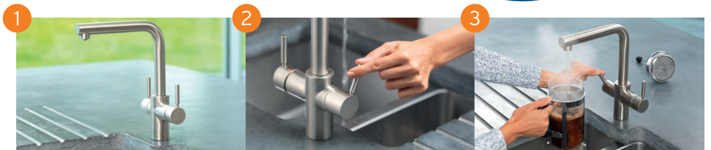
1 Contemporary Italian design