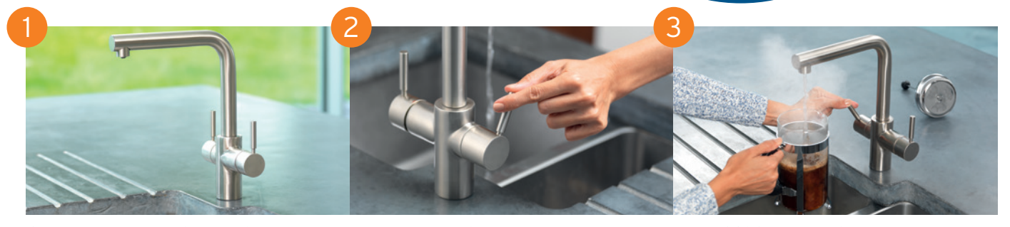
Contemporary Italian design